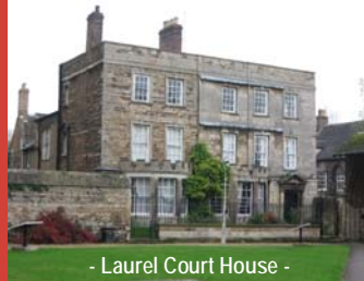
- Laurel Court House -

The project to repair and adapt the Category A Listed High Mill at Verdant Works, Dundee continues to progress with Dundee Heritage Trust having submitted a Stage 1 Application for HLF grant assistance. Historic Scotland have agreed to support this nationally important project in the form of a Buildings Repair Grant.