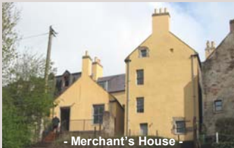
- Merchant's House -

The next phase of restoration and adaption at Albergo Casanova in Tuscany is under consideration for progression towards the construction stage. In Phase 1 the main Villa was adapted into a quality boutique hotel now awarded 5 star status.