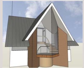
- Aitken Den, Letham Grange -

The Feasibility Studies to assist in exploring enhanced use for the Category A Listed Gardner Memorial Church in Brechin and the Category B Listed Lethnot Parish Church in Edzell are well underway and due for completion in Spring 2013. Both projects are likely to incorporate alterations and extensions that will result in more appropriate and relevant use of internal spaces within the buildings. The Feasibility Study to explore adaptive and enhanced use for the former Category B Listed Blaigowrie Hill Kirk is complete and the Blaigowrie Players are in the process of applying for grant funding assistance to move the project forward. Listed Building Consent has been received for the conservatory replacement in Broughty Ferry .