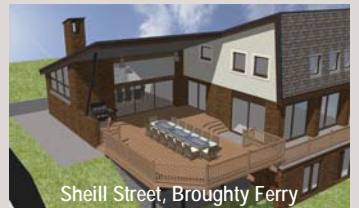
Sheill Street, Broughty Ferry