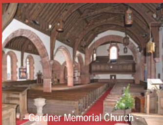
- Gardner Memorial Church -

The Feasibility Studies to assist in exploring enhanced use for the Category A Listed Gardner Memorial Church in Brechin and the Category B Listed Lethnot Parish Church in Edzell are well underway and due for completion in Spring 2013. Both projects are likely to incorporate alterations and extensions that will result in more appropriate and relevant use of internal spaces within the buildings. The Feasibility Study to explore adaptive and enhanced use for the former Category B Listed Blaigowrie Hill Kirk is complete and the Blaigowrie Players are in the process of applying for grant funding assistance to move the project forward. Listed Building Consent has been received for the conservatory replacement in Broughty Ferry .