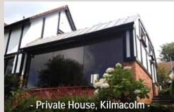
- Private House, Kilmacolm -