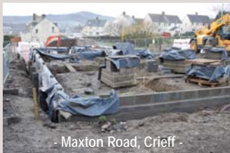
- Maxton Road, Crieff -