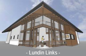
- Lundin Links -

At Planning Stage is the Holiday Home Provision for people affected by MS at Lundin Links, Fife for Homelands Trust.