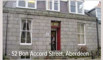
- 52 Bon Accord Street, Aberdeen -

We were recently listed in Urban Real magazine as one of the "Top 100 Architects" and as one of the 'practices to watch in 2013'.