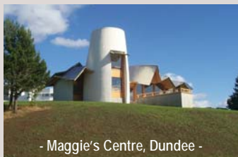
- Maggie's Centre, Dundee -

The new family room extension to replace a storm damaged conservatory at a private house at Kilmacolm makes the most of the magnificent, south facing view.