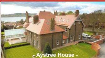
- Aystree House -

We were delighted to receive a total of 4 Awards at the recent DIA Awards Dinner. Our redevelopment of Aystree House in Broughty Ferry received the Award for Best Regeneration/Conservation Project, Aystree Stables won Best Interior Design Award and our client for these projects, Morton Properties (Dundee) Ltd secured the Best Commercial/Private Client Award, the third time one of our clients has won this award since it's inception in 2006. In addition to this, our redevelopment of the Merchant's House in Brechin received a Commendation in the Best Regeneration/Conservation category.