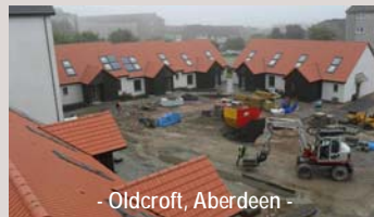
- Oldcroft, Aberdeen -

Housing developments at Marchburn Drive and Oldcroft, Aberdeen for Robertson Construction Eastern Ltd and Erskine/Dura Street, Dundee for Home Scotland have all recently been completed.