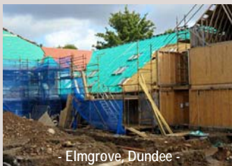
- Elmgrove, Dundee -

Following the sad news of the demise of WH Brown Construction , work has restarted on site for the Very Sheltered Housing at Elmgrove, Dundee with contractors George Martin Builders as well as the housing at Maxton Road, Crieff with contractors Muirfield Contracts both for Hillcrest Housing Association . Roofing works are also now complete at the Maggie's Centre, Dundee .