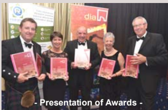
- Presentation of Awards -