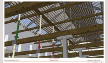
- High Mill, Verdant Works -