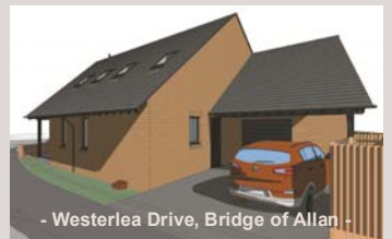
- Westerlea Drive, Bridge of Allan -