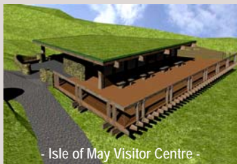
- Isle of May Visitor Centre -