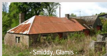
- Smiddy, Glamis -

Design proposals have been finalised for the Isle of May Visitors Facility and a detailed planning application has been submitted to Fife Council . The site lies within a National Nature Reserve and Site of Special Scientific Interest . Drawing work is progressing for: a house and garage extension at Letham Grange, Arbroath ; and we continue to liaise with our clients in Australia about their plans for the restoration of the Category C Listed Smiddy in Glamis . Initial sketches have been created for 15 proposed holiday houses and 2 new individual houses in St Andrews and we continue to work on the proposed modernisation of the Grade B Listed St Cyrus Church . We are also coordinating work on a new sprinkler system at David Irons, Forfar for Lord Strathmore . Detailed design work has commenced to develop 18 large private family houses within the village of Kingsbarns, Fife for Cambo Estate in partnership with Ogilvie Homes and work has commenced on the Feasibility Study for a new Visitor Centre in Braemar for Braemar Royal Society Highland Games .